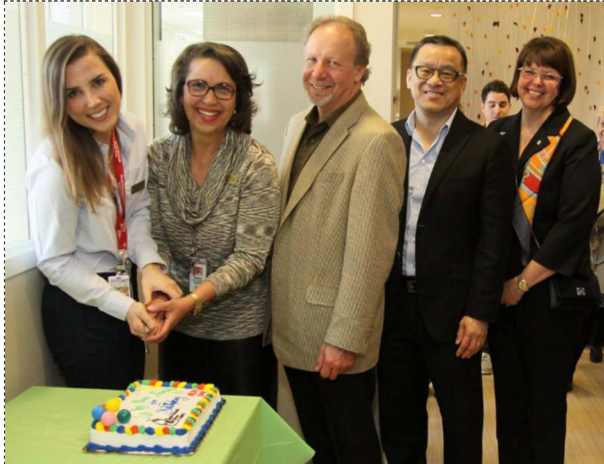
An e-newsletter for friends of Ronald McDonald House Toronto